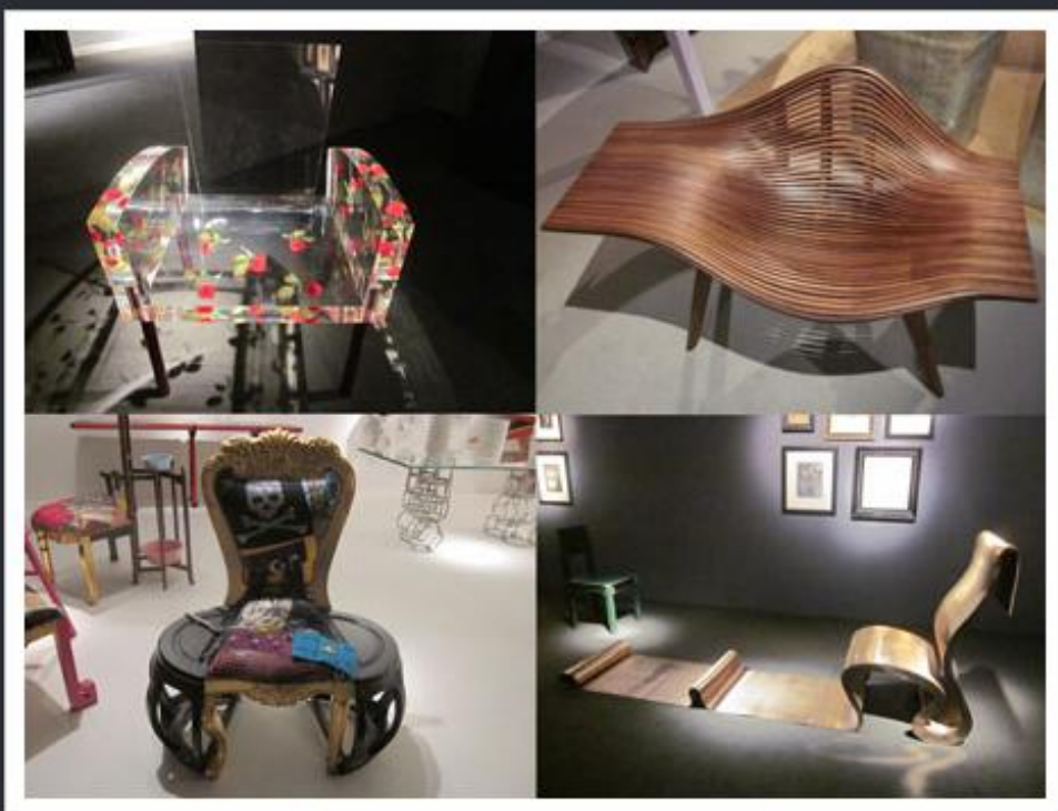
Friedman Benda (top left and bottom right), Pearl Lam Design (bottom left) and Gallery Seomi (top right)

I love Rob Pruitt's Glitter and enamel panda (he designed an exclusive capsule collection for Jimmy Choo ), the playful and iconic Roy Lichtenstein and the golden Samurai Tree by Gabriel Orozco. PAD London is definitely a feast for the eyes and we can also admire amazing chairs by celebrated designers such as Ron Arad.