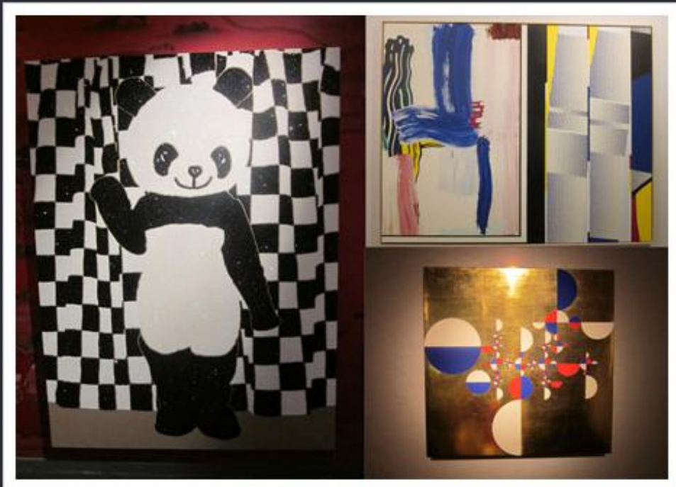
Rob Pruitt in Luxembourg & Dayan , Roy Lichtenstein in Castelli Gallery and Gabriel Orozco in Mitchell-Innes & Nash

I love Rob Pruitt's Glitter and enamel panda (he designed an exclusive capsule collection for Jimmy Choo ), the playful and iconic Roy Lichtenstein and the golden Samurai Tree by Gabriel Orozco. PAD London is definitely a feast for the eyes and we can also admire amazing chairs by celebrated designers such as Ron Arad.