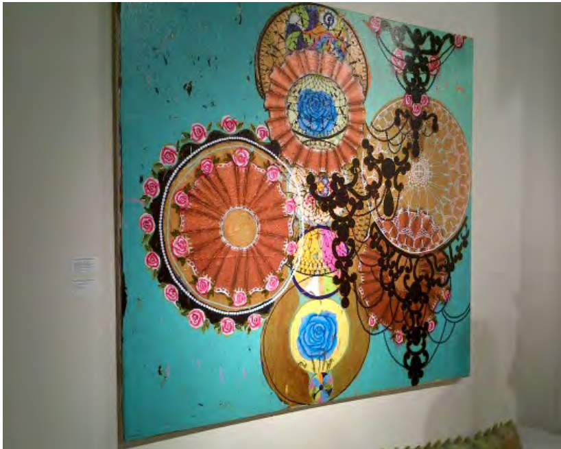
Beatriz Milhazes' Children Made a Snowman .

Much is being said (and written) about the strength of "The Brazilians" at Art Basel Miami Beach. Certainly there are important collectors here, but they do not outnumber their European and American counterparts. What did stand out for me was the variety and strength of artwork on display at the fair from young, contemporary artists from Latin America that are working today - not all still working in their native country. Highlights and works not to miss at the fair follow