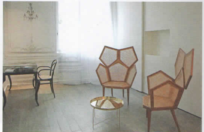
"On my to-do list this summer is a visit to La Maison Champs Elysees, the Paris hotel designed by Martin Margiela."