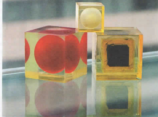
Examples of Enzo Mari's optical experiments from the 1960s

"Enzo Mari is one of the great legends of design I have yet to meet. He's a man with a truly fascinating mind and incredible vision. I love his book 'Autoprogettazione,' which shows you how to build furniture yourself. It's the most sophisticated DIY ever."