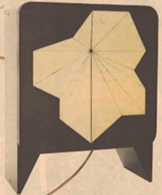
▼ Sunrise carpet (1987) by Nanda Vigo at Erastudio Apartment Galler