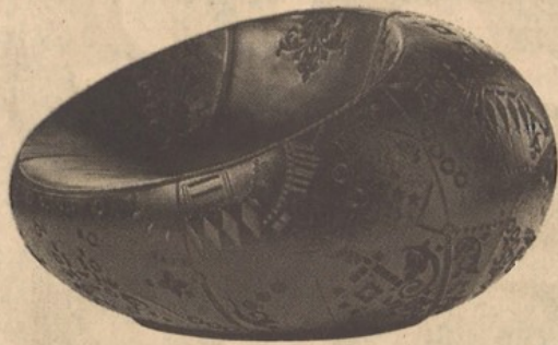
▲ 'Odjursäte Murmur (Dark Version)' (2016) by Marcel Wanders at Friedman Benda