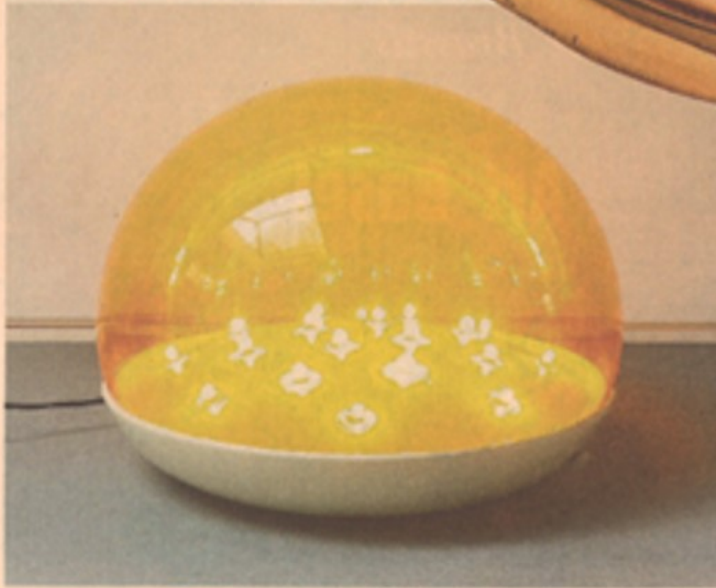
▼ Moon Lamp (1969) by Gino Sarfatti at Jousse Entreprise