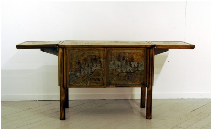
Philip & Kelvin LaVerne, Chan Bar