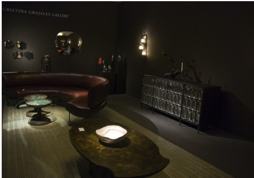
Pavilion of Art and Design, New York 2011