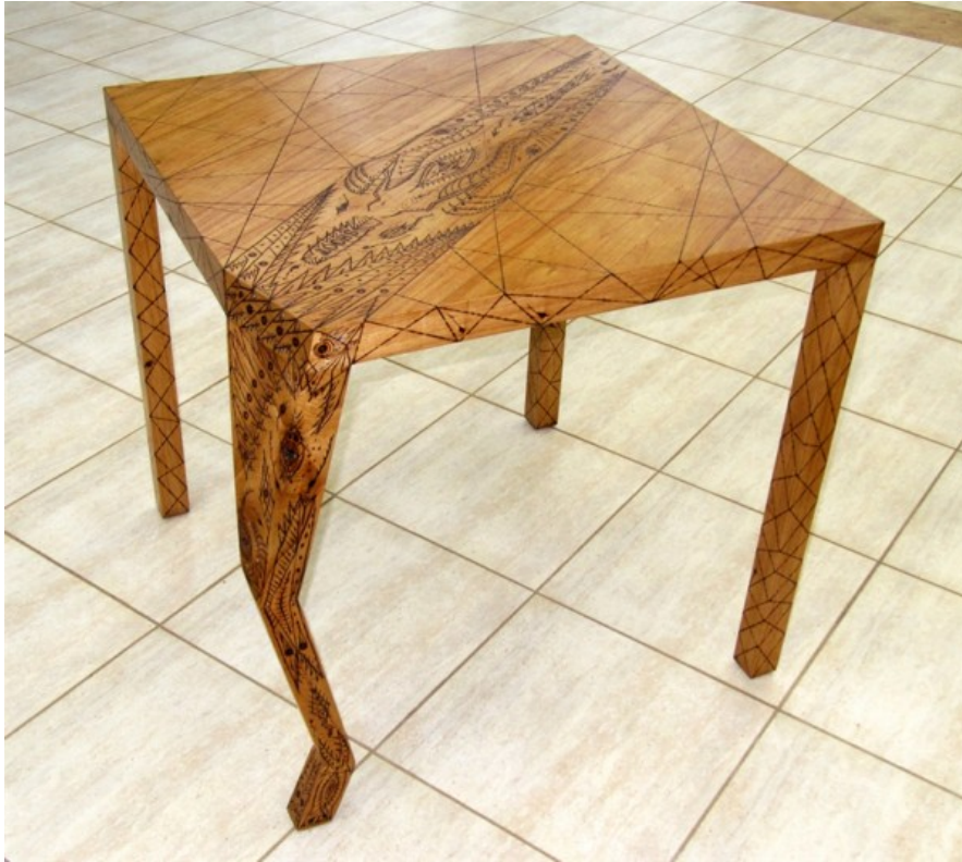
Pedro Barrail, Tattoo Breakfast Table