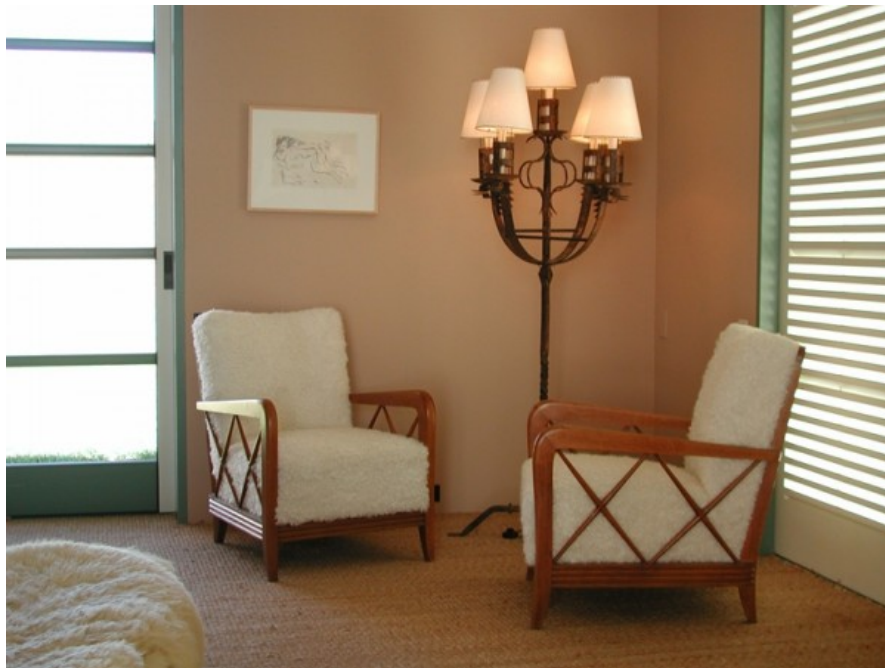
Winery, Santa Ynez Valley, California