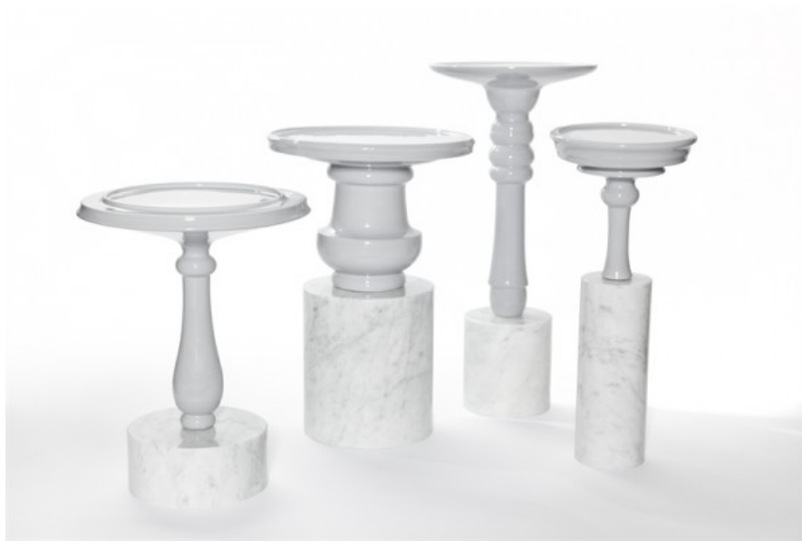
Sam Baron, Bouquet de Tables