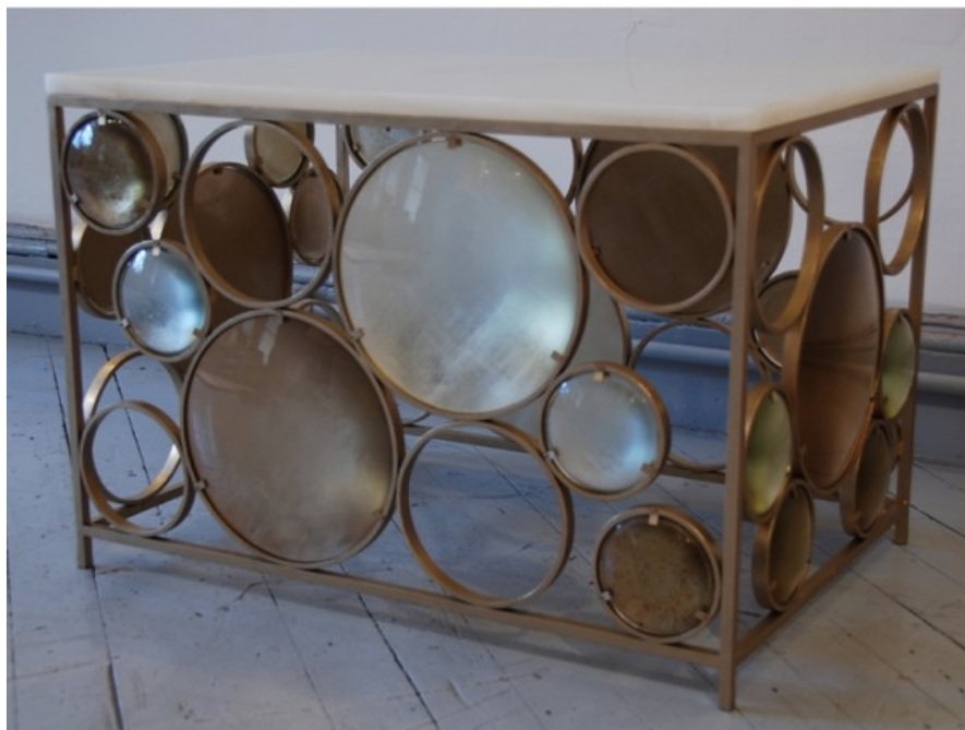
Christophe Come table in iron with moongold leaf, glass roundels and white gold leaf