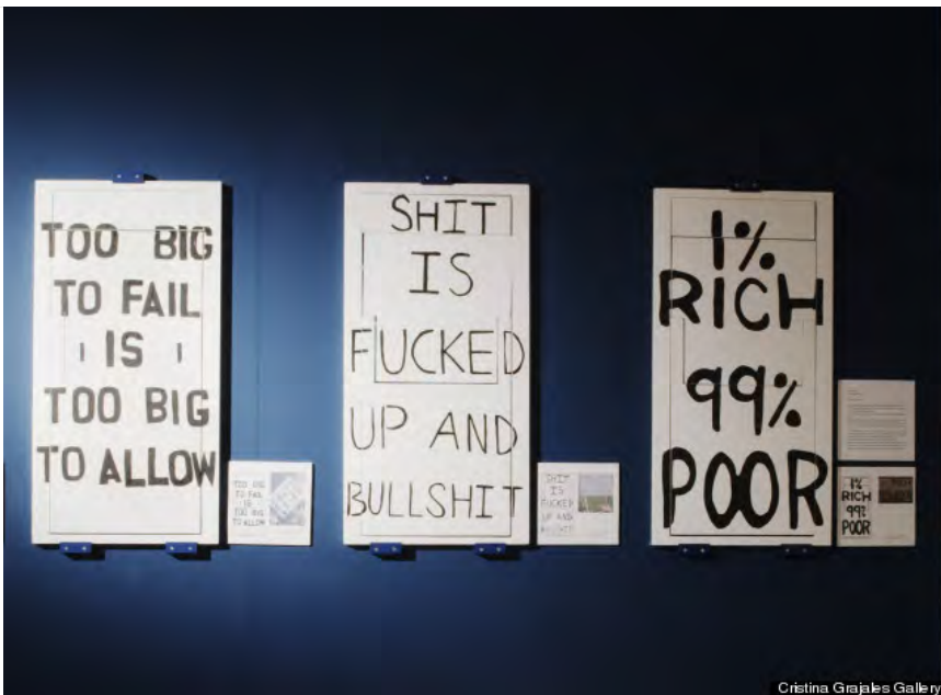
Cristina Grajales Gallery

The furniture was first created as signage that doubled as fold-out chairs for protesters during the long demonstrations. But the chairs have moved onto phase two of their multi-faceted deployment plan. The artist behind "Occupy Chairs" now seems to want to infiltrate the homes of the 1% with his obvious protest paraphernalia by inviting wealthy collectors to purchase the "works of art" at exorbitant prices -- $3,500 a pop! Sure, the residents of the Financial District can be faux-art enthusiasts willing to spend money on horrendous examples of contemporary art, but they wouldn't be vapid enough to actually buy a piece of furniture that blatantly expresses hatred towards its intended buyer. Right?