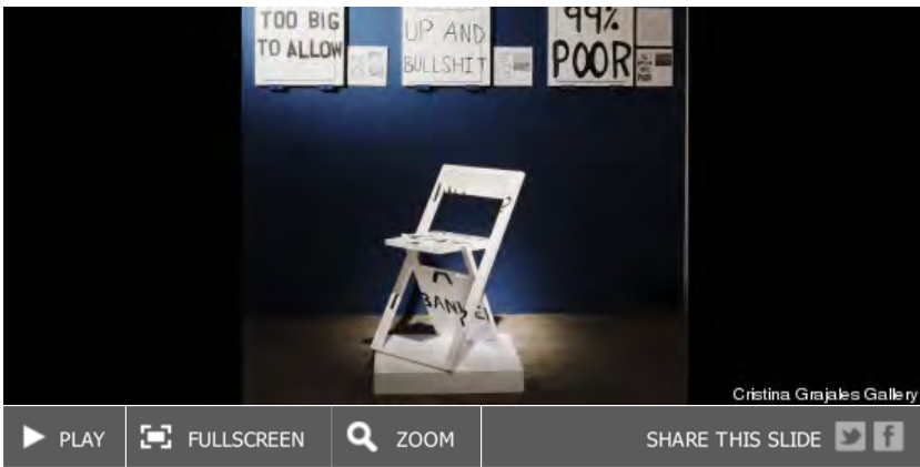
Cristina Grajales Gallery